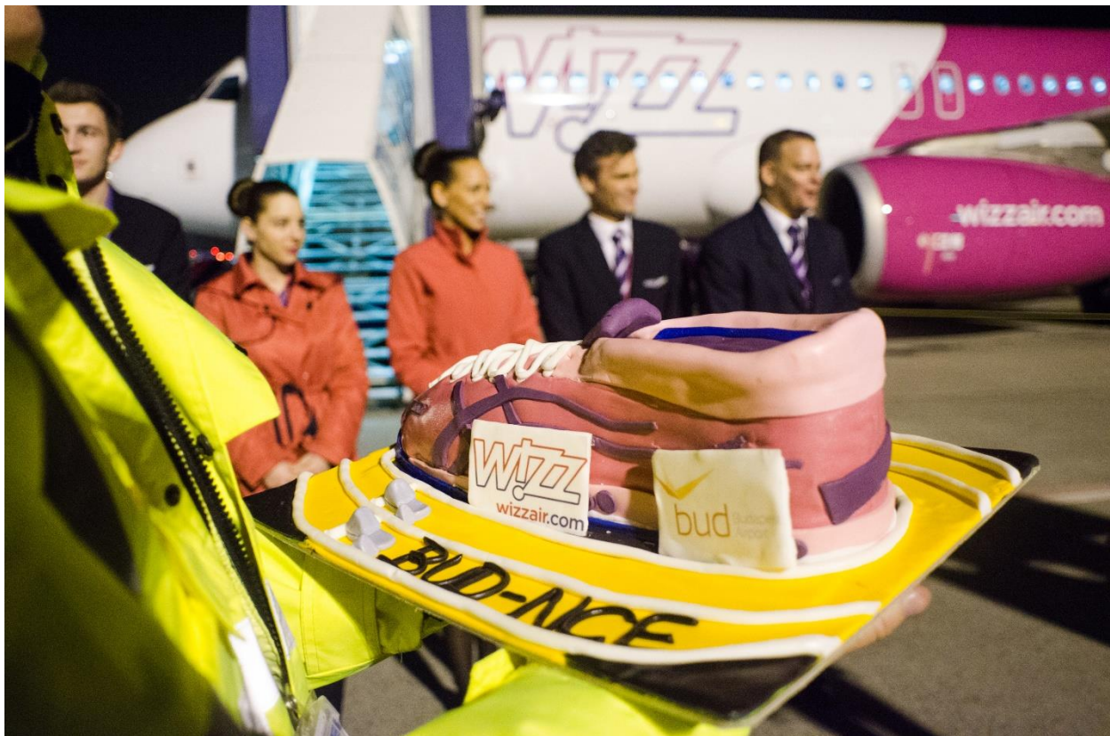
Photo caption: Budapest Airport welcomed Wizz Air's twice-weekly service to Nice with a traditional cake in the shape of the now-familiar sight of running shoes on the Hungarian gateway's runway.

Starting its fourth German route, Wizz Air's additional link to Karlsruhe/Baden-Baden will then give the ULCC a 12% share of all of Budapest's scheduled seats to the German market. Commencing Budapest's new connection on 11 March, Wizz Air adds another 360 weekly seats from the capital city airport to Germany.