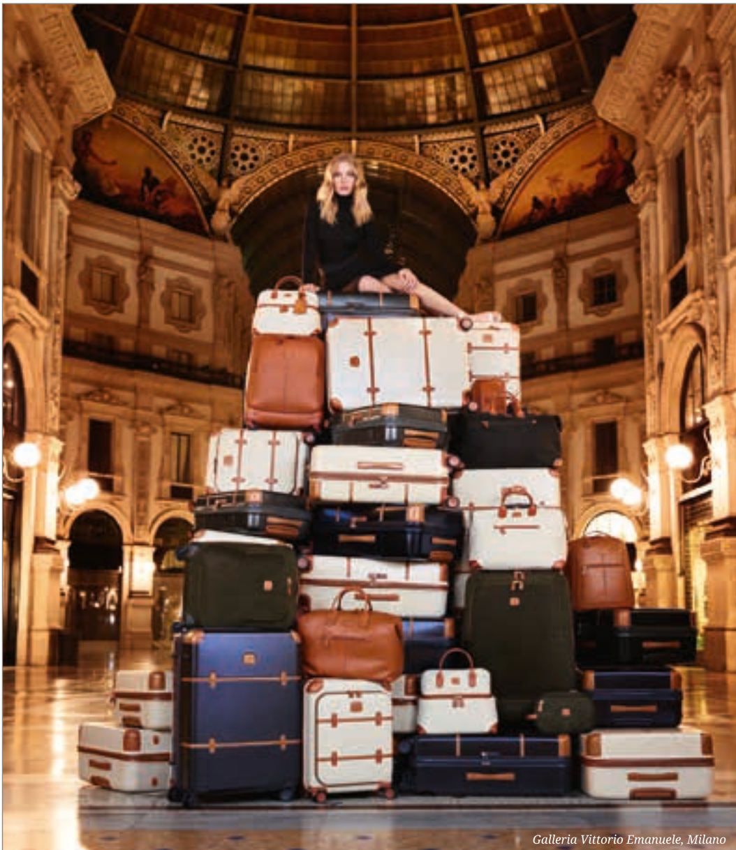
Galleria Vittorio Emanuele, Milano