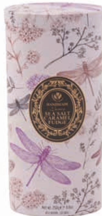
Red Village M27

everyday running of the business, and together they ensure that the highest standards are maintained across every aspect of the company. Gardiners Feathers Chocolate Fudge Tin 250g is a beautifully patterned tin, featuring a feather decoration, which contains individually wrapped pieces of traditionally made chocolate fudge. Gardiners Dragonfly Sea Salt Caramel Tin 250g is, similarly, a beautifully patterned tin. It is decorated with flowers and dragonflies, and contains individually wrapped pieces of traditionally made Sea Salt Caramel Fudge. Finally, the Gardiners Lillies Assorted Fudge Tin 250g is also a beautifully patterned tin, featuring lillies. It contains individually wrapped pieces of traditionally made assorted fudge, including Ginger, Rum & Raisin and Apple & Cinnamon.