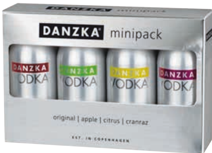
Green Village H52

or hand baggage, which makes it the perfect travel gift. The new mini-pack contains four 50ml DANZKA Vodka bottles with a nice selection of flavours, including Original, Citrus, Cranraz, and Apple, with an attractive price point.