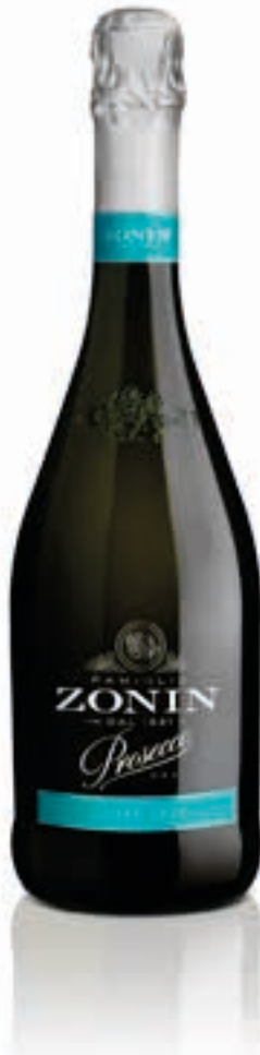
Blue Village C5

been highly regarded for quality, authenticity, and attractive reference to the Italian lifestyle. Recent in-depth research led to the idea that new value and visibility could be given to Zonin Prosecco. The goal was to boost its distinctiveness and strong character with a contemporary and elegant restyling. As a result, in Cannes the Zonin family presents the new Zonin Prosecco Cuvée 1821 pack – a smart and fresh evolution, characterised by a larger logo on a refined, but noticeable, teal-coloured background.