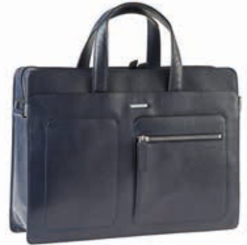
Bay Village Bay 14

calf leather bags get their appeal for a simplicity of design, with round construction handles. A metal turning lock application accentuates the timeless look, while bags have a detachable shoulder strap and an inner compartment. Cerruti 1881 is also showcasing timepieces highlights for Fall/Winter 2017.