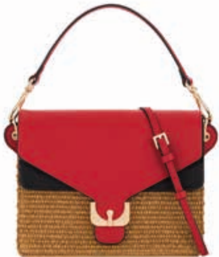
Bay Village Bay 1A

Coccinelle creations, such as Ambrine and Arlettis, is conveyed in unexpected materials and colours. Rattan, ethnic patterns, bold fastenings, zig zags, prints and embroidery, blend just like on an imaginary totem pole. Materials and craftsmanship merge, transforming every bag into a decorative self-statement of style and identity. Freis and Spontanè have more delicate undertones, with subtle shades of wild flowers and the freshness of meadow dew. Colours, nuances and prints offer a gentle, unexpected femininity and lightness. An air of romanticism is implied by pastel suedes and two-tone lace details.