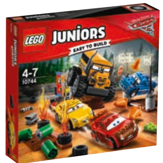
Marine Village S1

Garage' set, 'Willy's Butte Speed Training' set, and 'Florida 500 Final Race' set. More adventures with Disney•Pixar Cars 3 sets are promised by 'Mater's Junkyard' and 'Guido and Luigi's Pit Stop'.